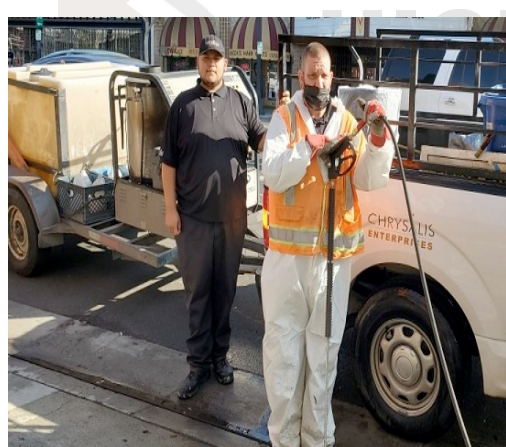
Pressure Washing Hours 88