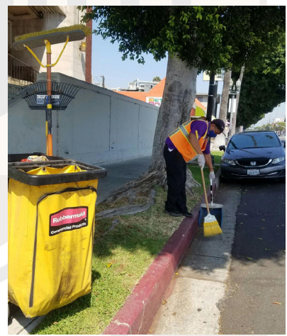
Bulky Items Picked up 408