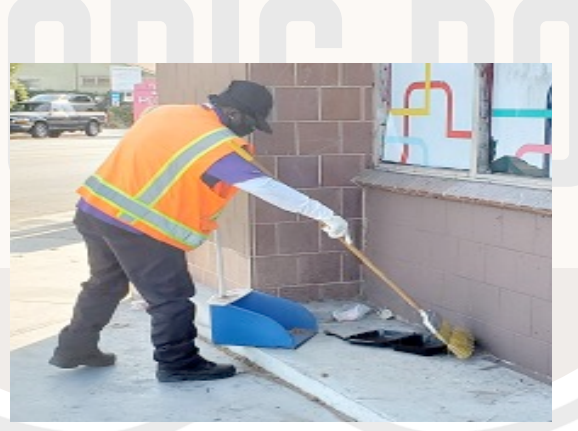
Trash Bags Picked up 9,563 Graffiti Tags Removed 1,540