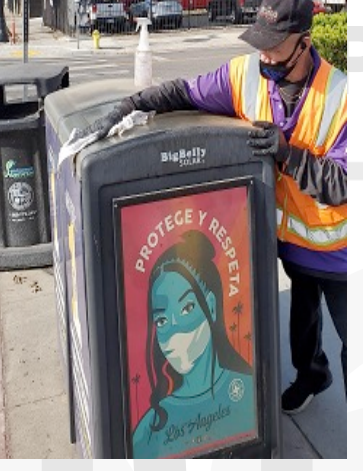
Trash Weight in lbs 219,949