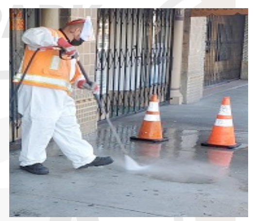
Pressure Washing is 1st Thurs./month