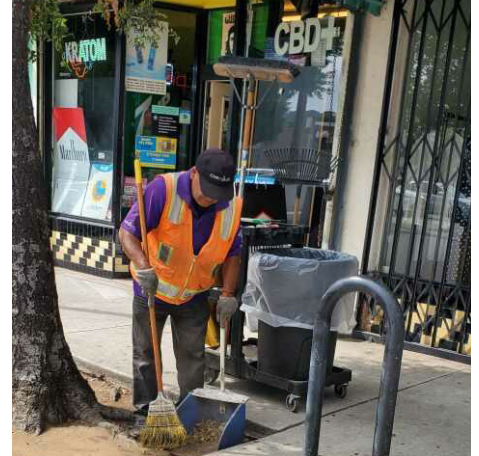
Chrysalis clean team sweeping trash