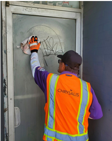
Chrysalis clean team removing graffiti tags